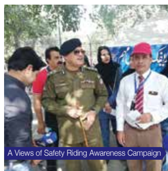
A Views of Safety Riding Awareness Campaign

The Company coordinates with the traffic police department to create awareness about the use of indicators, side mirrors and helmets. Under this campaign, the Company distributed 112,627 pamphlets nationwide. Moreover, 750 helmets and 1,117 sets of back view mirrors were distributed. 7,626 lights were checked and replaced.