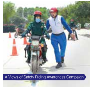
A Views of Safety Riding Awareness Campaign