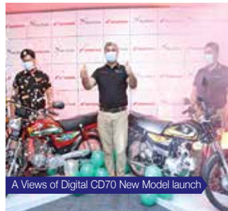
A Views of Digital CD70 New Model launch