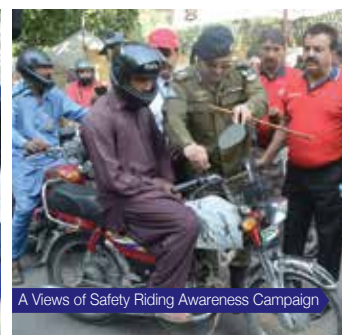
A Views of Safety Riding Awareness Campaign