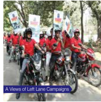
A Views of Left Lane Campaigns