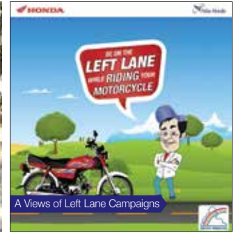
A Views of Left Lane Campaigns

AHL continues to strive and make efforts to raise awareness regarding separate left lane for motorcyclists. This was done through left lane awareness campaigns and distribution of brochures, placement of standees, steamers & pylons and raising awareness through social media platforms also. During the year, social gatherings were kept at a minimum, keeping in view the current pandemic outbreak and social distancing SOPs issued by the Government. 1,293 steamers were installed during left lane campaign for motorcycles covering 6 major cities including Lahore, Faisalabad, Rawalpindi, Islamabad, Multan & Karachi.