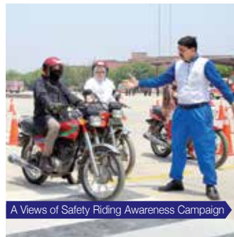
A Views of Safety Riding Awareness Campaign