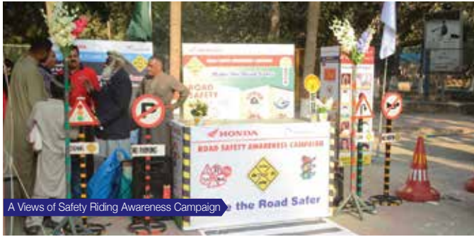
A Views of Safety Riding Awareness Campaign